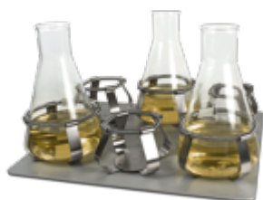
HSP-6/1000 Platform with 6 tight fit clamps for 1000 ml flasks (360x400 mm)