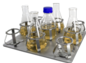
HSP-9/500 Platform with 9 tight fit clamps for 500 ml flasks (360x400 mm)