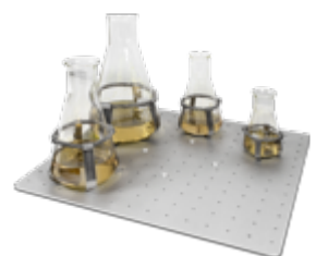
UP-168 Universal platform with clamps can accommodate flasks or bottles of different volume sizes. Clamps are not included with platform and need to be ordered separately. (360x400 mm)