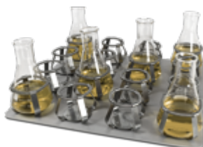
HSP-16/250 Platform with 16 tight fit clamps for 250-300 ml flasks (360x400 mm)